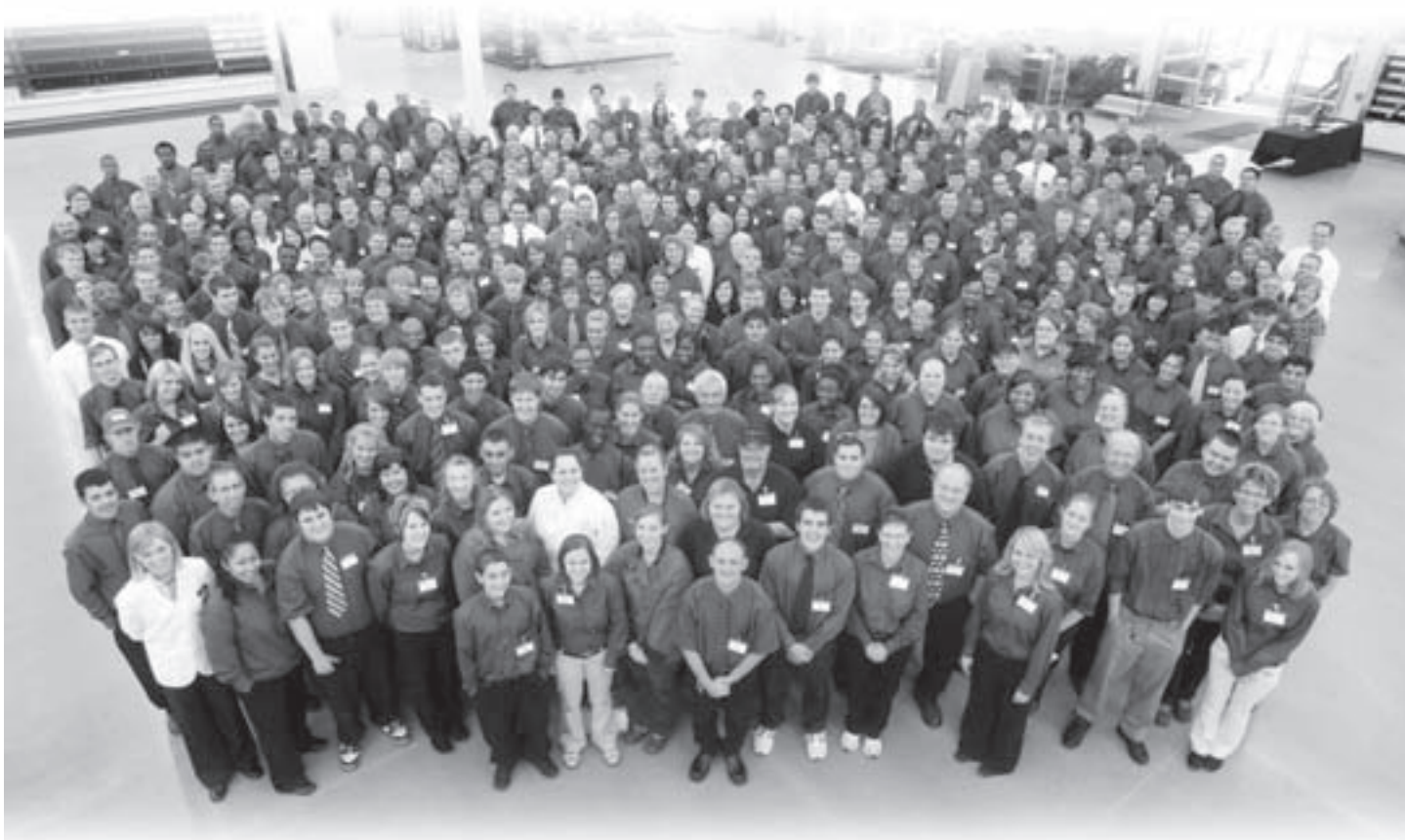
Several hundred employees gather to help get the new Hy-Vee ready for opening on Oct 7th.