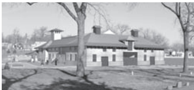
Artist's rendition of renovated Stables

The Stables building at Wyuka Cemetery is located down a slope from the main “O” Street gate, near the bridge at the end of the lake. Built in 1906, the Craftsman-style Stables are listed on the National Register of Historic Places. The building once housed the horses that performed the heavy work in the cemetery. Oral history accounts tell us that the horses which pulled the first trolley cars out “O” Street rested at the Stables.