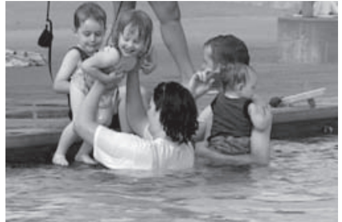
Witherbee family enjoys 2007 free pool party.