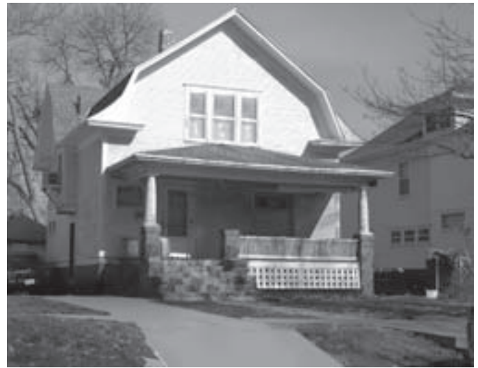
(After) Storing items out of view and maintaining the yard and driveway creates clean lines and increases curb appeal.