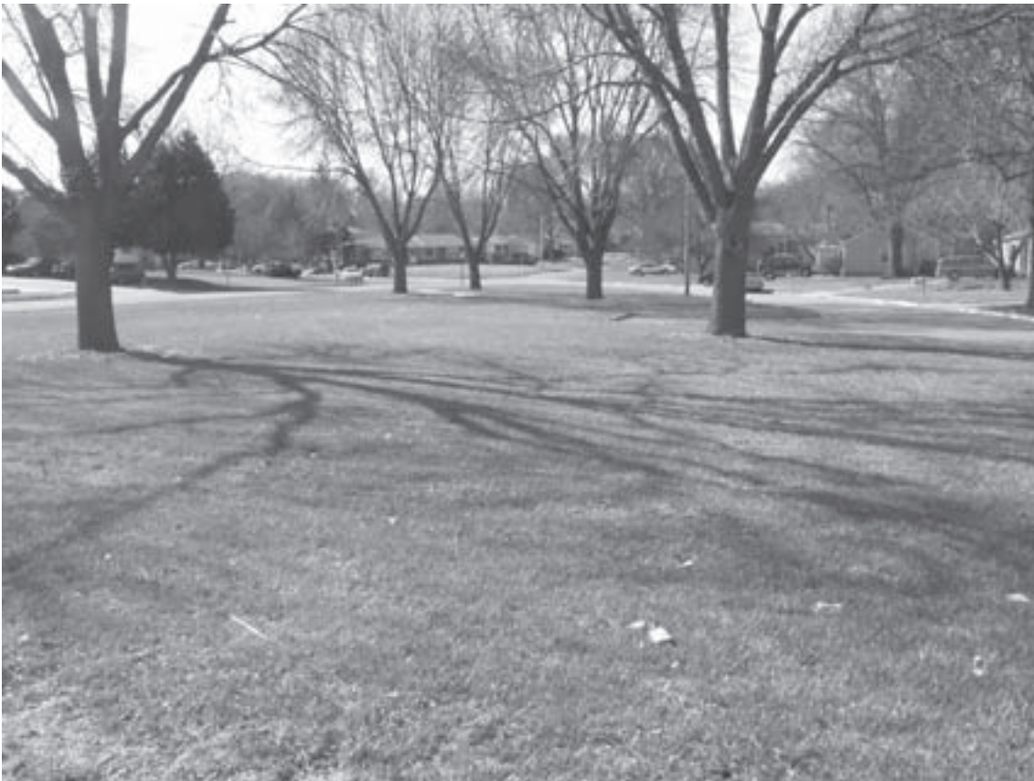
Current view of Witherbee Park area from O St.