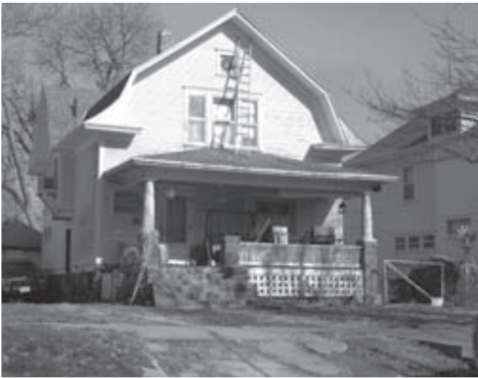
(Before) Storing items viewable from the street and not maintaining the yard reduces curb appeal.