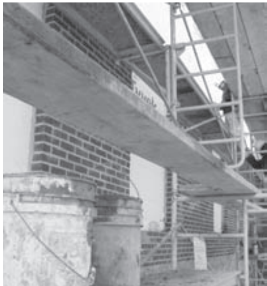
The East Side of the south entrances is being refaced with new brick.