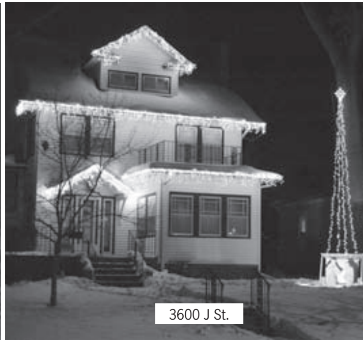
3600 J St.