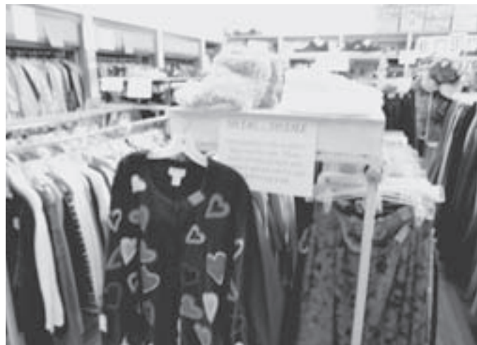
Valentines day is right around the corner. A lucky shopper will be wearing this recycled top.