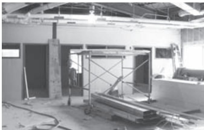
New offices on 3 South receive the final framing touches.

We thank you for patience as construction crews are in our neighborhood for the next few months. Catch our transformation as it happens by visiting our Web site at www.Tabitha.org (click on See Tabitha's Construction Project). Stay tuned for invitations to upcoming events! Feel free to contact Tabitha Public Relations at 486-8559 or pr@Tabitha.org .