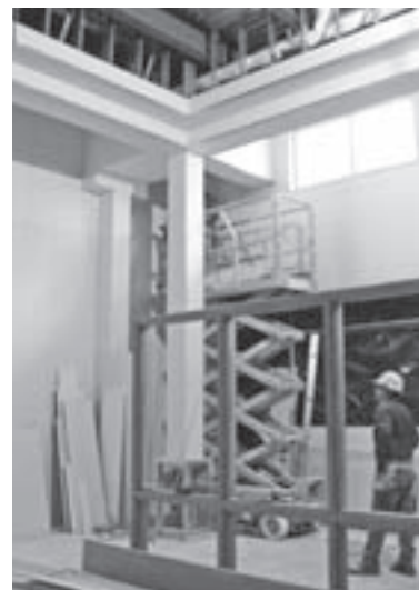
Tabitha's former courtyard framing is complete and crews are now installing drywall.

The construction area was enclosed just in time for winter's harsh weather and most of the crews are working on interiors. The framing is nearly complete with drywall installation beginning. Heating, electrical and mechanical have been roughed in and insulating is almost done. When the outside temperature is more tolerable, one crew is laying new brick on the east side of the new expansion. The target completion date for the South Entrance is early May 2010.