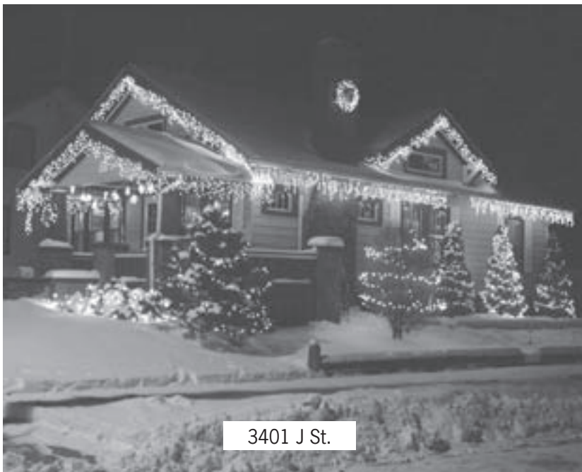
3401 J St.