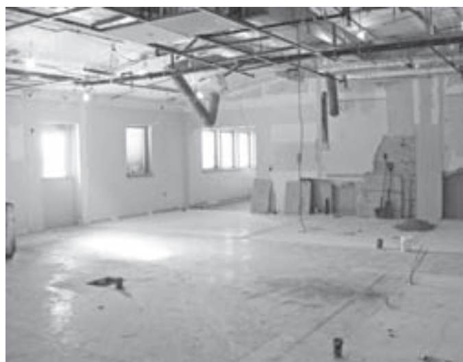
Construction started in January 2010 to convert the former Intergenerational Center into Tabitha's second Green House® Project.

Your Wetherbee Neighborhood styling/barber salon at 42 nd & O —for the past 23 years Monday-Saturday—early and late—walk-in or appointments