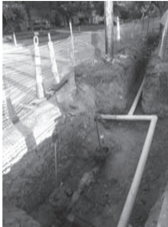
Gas company replacing 70 yr. old pipes.

Directional boring is a process used by the various utilities and construction companies that bore to install or replace pipes. This remotely controlled horizontal drilling allows the cast iron gas pipes to be replaced without digging