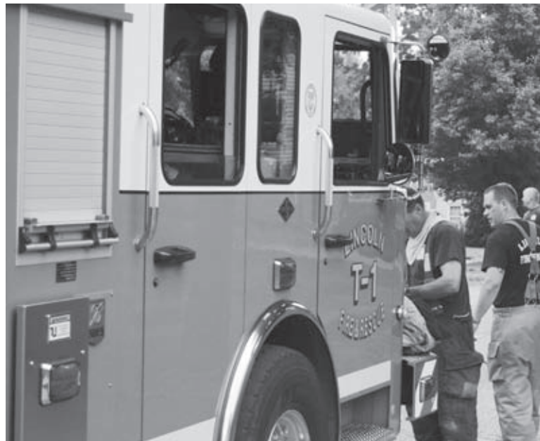
Witherbee Neighborhood home drew 10 units from L