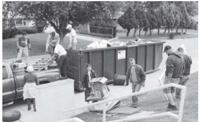
Nine of 26 volunteers fill a roll-off during this year's neighborhood cleanup.