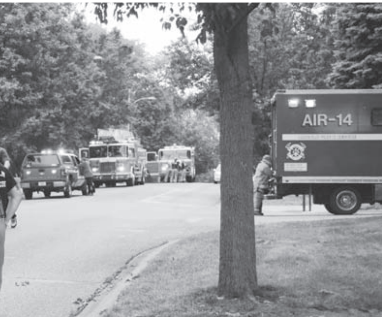
Lincoln Fire & Rescue. See story on page 12.

The future of Lincoln Fire and Rescue is being shaped now. It is up to us, the residents of Lincoln, to determine that future. If you have thoughts and suggestions, or simply want more information, then now is the time to get involved. Don't wait until after decisions have been made to voice your opinion. This will be an interesting and informative meeting. Don't miss it!!!