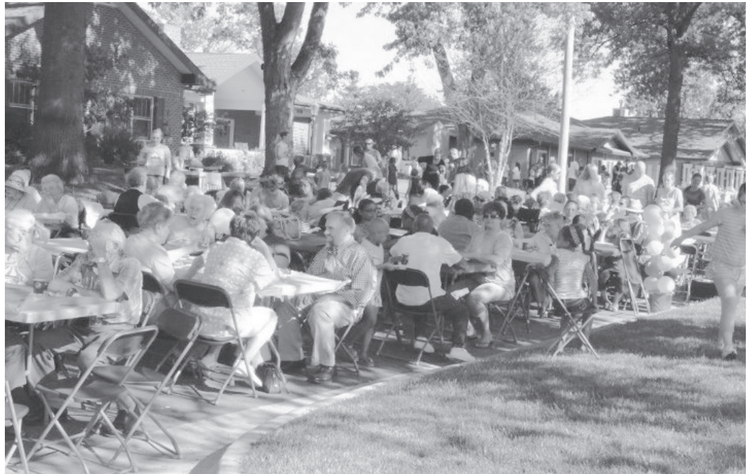
Hundreds gathered for this year's Tabitha Block Party

As a nonprofit organization serving 28 Nebraska counties, Tabitha's love embraces a society where