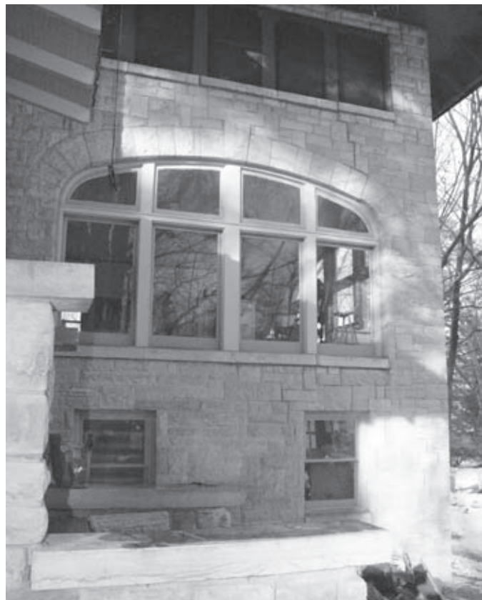
Beautiful windows grace Hamilton House