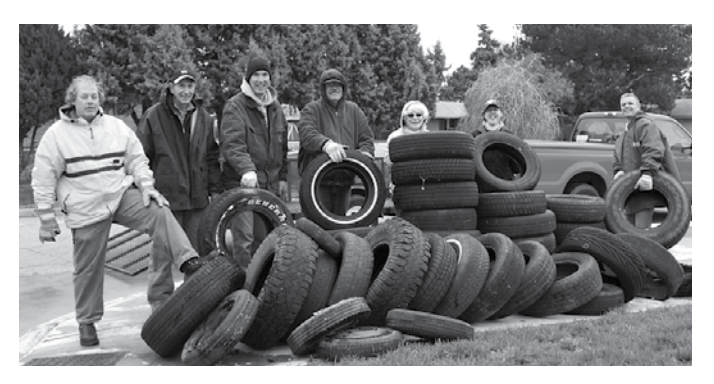
Volunteers load scrap tires at the WNA Cleanup in 2013.

This cleanup event is funded by a grant from "Keep Lincoln and Lancaster County Beautiful". Food and beverages are donated by Braeda & Midtown Hy-Vee. Refuse hauling is provided by Niederhaus Refuse Services at a discounted rate.