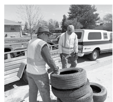
Loading tires to be recycled.

The metal and household appliances (washers, dryers, stoves, refrigera-