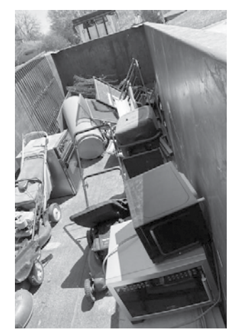
Metal hauled to Alter Trading to be cleanup .

Do you have construction material and items such as windows and doors from building/remodeling projects as well as leftover lawn and landscaping materials and furniture in good condition? These items are collected and donated to the new Habitat for Humanity ReStore at 5601 S 59th Street.