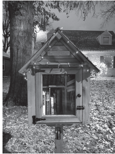
Lighting up Reading was a clever spin on Holiday Lights.

Visions of Sugarplums: 354 S 54th Street; Stacy & A.J. Schuman