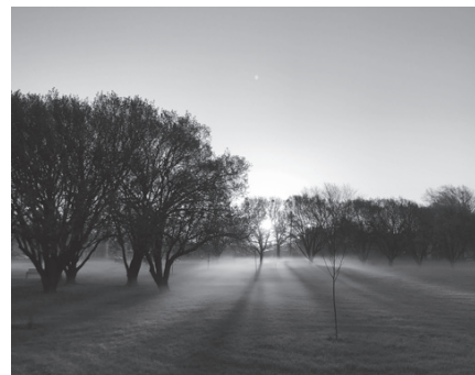
Serence Woods Park vista.