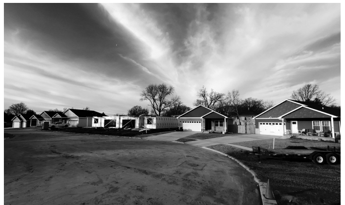
Of the 13 homes approved in the Randolph Circle plan, eight are nearly done and two more are now being framed. Most of the new owners are from or near Lincoln, some from within the Witherbee area, and most are active in their careers.

"We look forward to meeting the new Witherbee neighbors and hope they will want to join WNA and participate in our activities," Holland added.