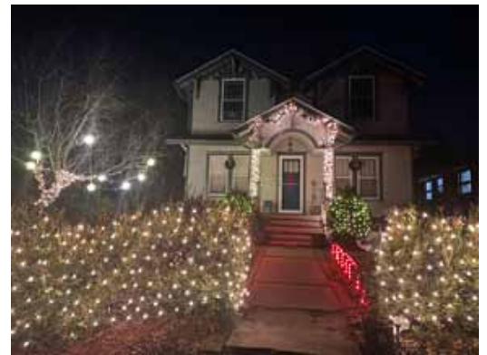
LES Superior Customer