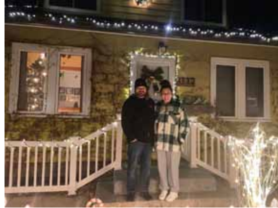
Can't Take My Eyes Off of You

Congratulations to ALL the participants!