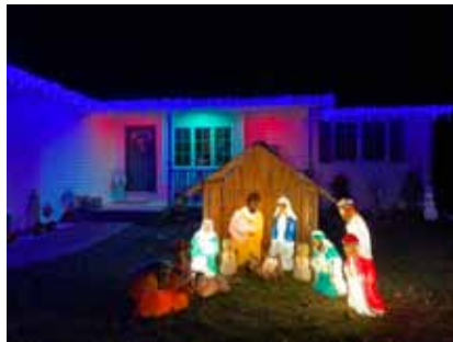
Reason for the Season