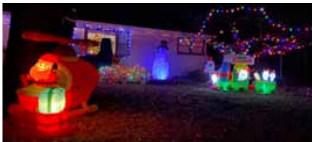
Visions of Sugar Plums