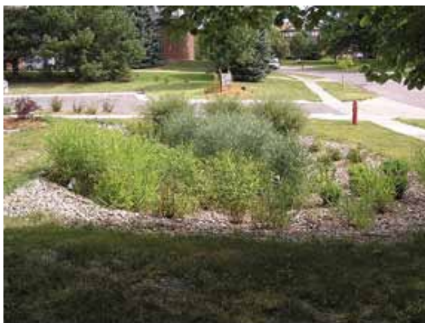
Rain gardens capture runoff from hard surfaces like parking areas and driveways. The runoff filters into the surrounding soil, reducing the need for watering.

Circle Thursday, March 21st on your calendar and plan to attend the WNA meeting, 7 pm at Redeemer Lutheran Church, 510 S. 33rd St.