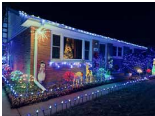
308 S 54th St