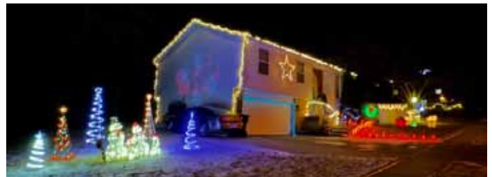
4811 L St.

Congratulations to our 2025 winners. So many lights, so little time! Nominate yourself or a neighbor in the coming year! We are looking to add a Halloween decorating contest in 2026!