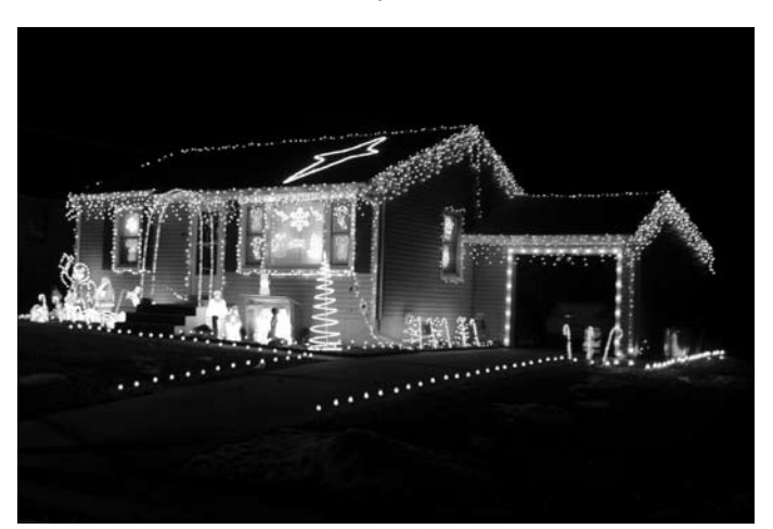
5041 L Street

The Kaufman family at 5101 M Street won first