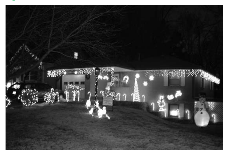
5101 M Street

prize and received an Italian table lamp from Lincoln Lighting Center, coupons from Perkins and Runza and the winning yard sign, as well as bragging rights. The runners up at 4300 Witherbee Boulevard and 5041 L Street received gifts from Pink Flamingo and Perfect 10 Nails in addition to their Perkins and Runza coupons.